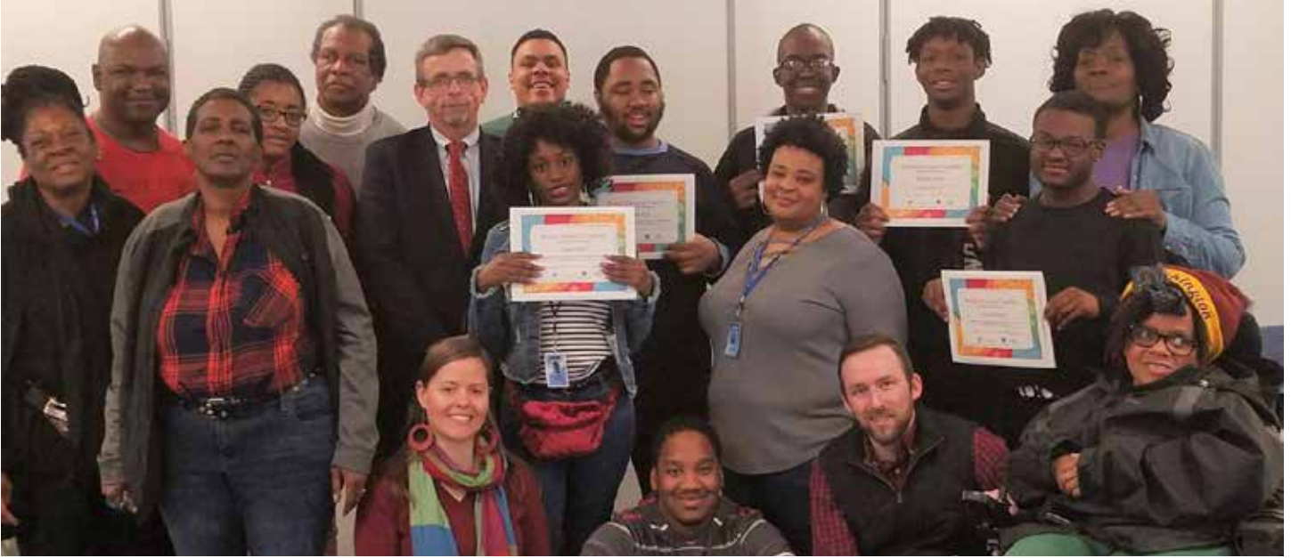
Meet the St. Coletta students who completed our first People Planning Together for Employment training for in-school program. The course, led by adults with disabilities, helped students identify career interests & chart a path to reach their goals. #BrightFutures #DDAwareness19