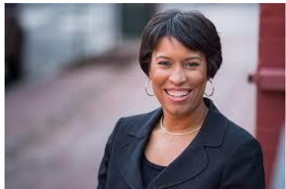
Image Description 4: Headshot of Mayor Muriel Bowser smiling and wearing a black suit against a blurred background.

The DC Mayor has the power to ask for bills to be introduced or to veto (reject) a bill that the Council of DC votes to pass. If a bill is introduced at the request of the Mayor, then you know that the Mayor supports it. To advocate about a bill in this instance, you can write or make an appointment with the relevant Deputy Mayor. The Office of the Deputy Mayor for Health and Human Services advises and supports the Mayor on many issues relating to people with disabilities and their family members in DC.