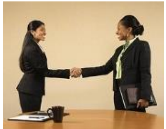
Image Description 6: Two women in black suits shaking hands in front of a table with a coffee mug and notepad on it.