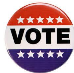
Image Description 7: Red, white and blue button with black letters that read, "VOTE."

Make sure you are registered to vote and make it clear to your Councilmember that you will vote based on this issue.