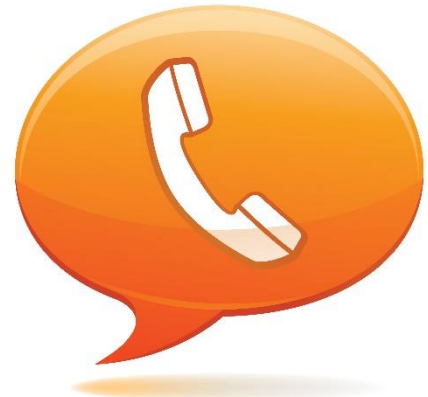
Image Description 5: Picture of a white telephone inside an orange speech bubble.