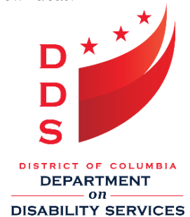
Image Description 3: The logo for the Department on Disability Services shows the letters D-D-S in a vertical pattern next to the three red stars and two red stripes of the DC flag sloping upward to the right.

You can advocate at this level by writing a letter or email to let the Director of the agency most connected with the bill. You also can work with other people with disabilities or their family members to set up a meeting with the Director to encourage the agency leadership to hear your thoughts.