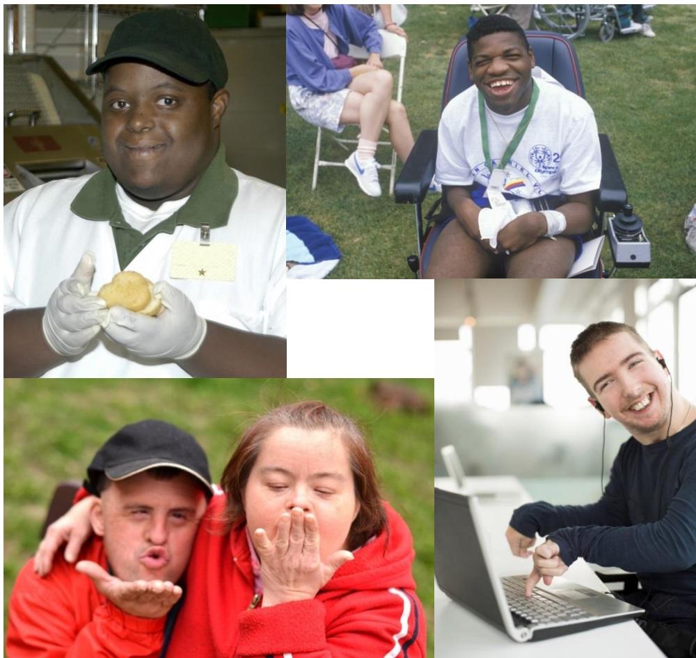
Image Description 8: Upper left - A man in a green hat, a white shirt and white plastic gloves as he handles fresh baked bread and smiles. Upper right - A man is sitting in a power wheelchair wearing a white Special Olympics t-shirt and blue shorts with a medal around his neck and a smile on his face. Bottom left - Two people in red jackets have their arms around each other as they blow kisses into the air in front of them. Bottom right - A smiling man is wearing a blue shirt and headphones as he types onto a laptop using one finger.

Advocacy is a marathon, not a sprint. And marathons are hard! When we are thinking about and working for system-wide change, we need to be patient and find ways to stay motivated when the change is slow. We need to support each other and keep our vision alive of creating a world where everyone is able to journey toward their goals and dreams. Advocacy is about speaking out and making your voice heard, educating people, showing up, working together with allies and coalitions, developing relationships with decision makers and holding on to a vision for a better District of Columbia and a better world.